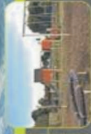
વિડેન્ગ પ્લે એરિયા